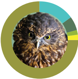
ARANZ INCOME 2017-2018