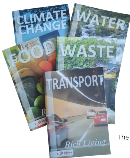
The Rich Living series

While children are exploring creation care by connecting with creation, adults could explore the " Rich Living " series" or have intergenerational engagement on creation care themes. However the resource can also stand alone. This resource is particularly suited to church communities already involved in Eco Church NZ .